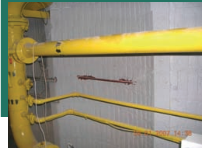
Vaults have become convenient locations for utility lines.