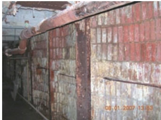
The outer wall of this vault is brick.