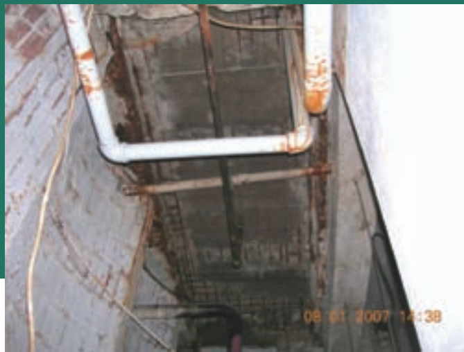
View of a vault roof with several pipe runs located directly below the sidewalk.