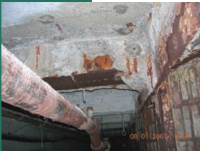
Inside a typical vault: The top of the vault is the bottom of the sidewalk slab with, in this instance, a support beam.

Equally as uncertain was the City department with jurisdiction over these structures, as lines of responsibility were crossed. As the vaults were structures attached to buildings, they could be overseen by the City's Department of Licenses and Inspections. But, they were within the public right-of-way (the domain of the Department of Streets) and often housed underground utilities (also managed by Streets). As no single governmental agency took stewardship, there were generally no public records on vaults.