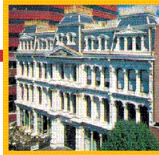
Winterthur Museums & Gardens