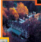
Christiana Hilton Conference Center Newark, Delaware